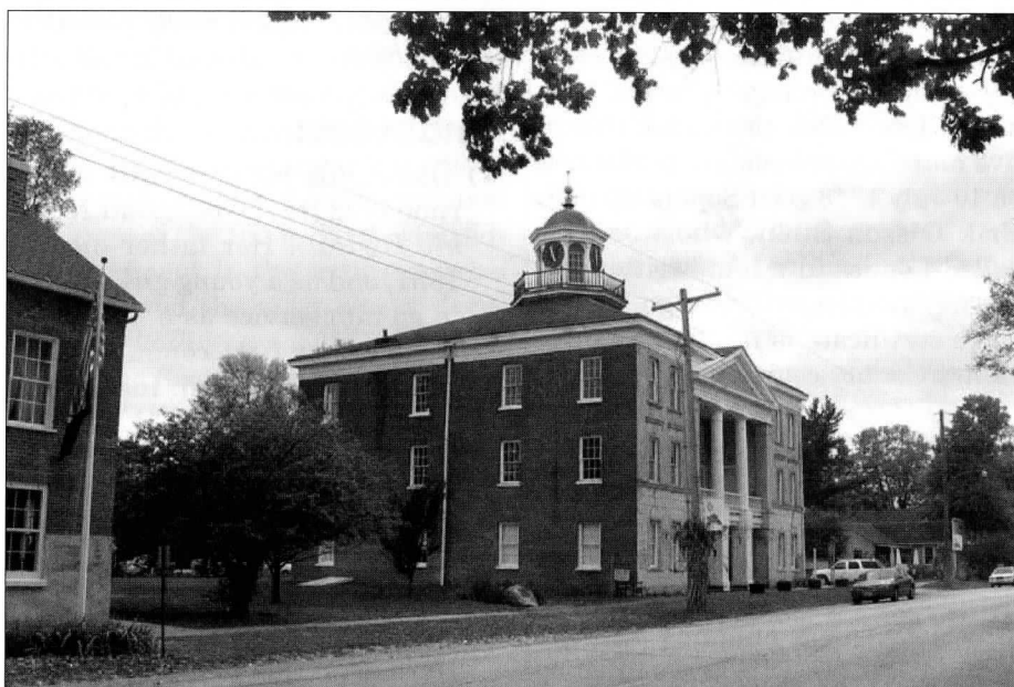
The Steeple building in Bishop Hill.