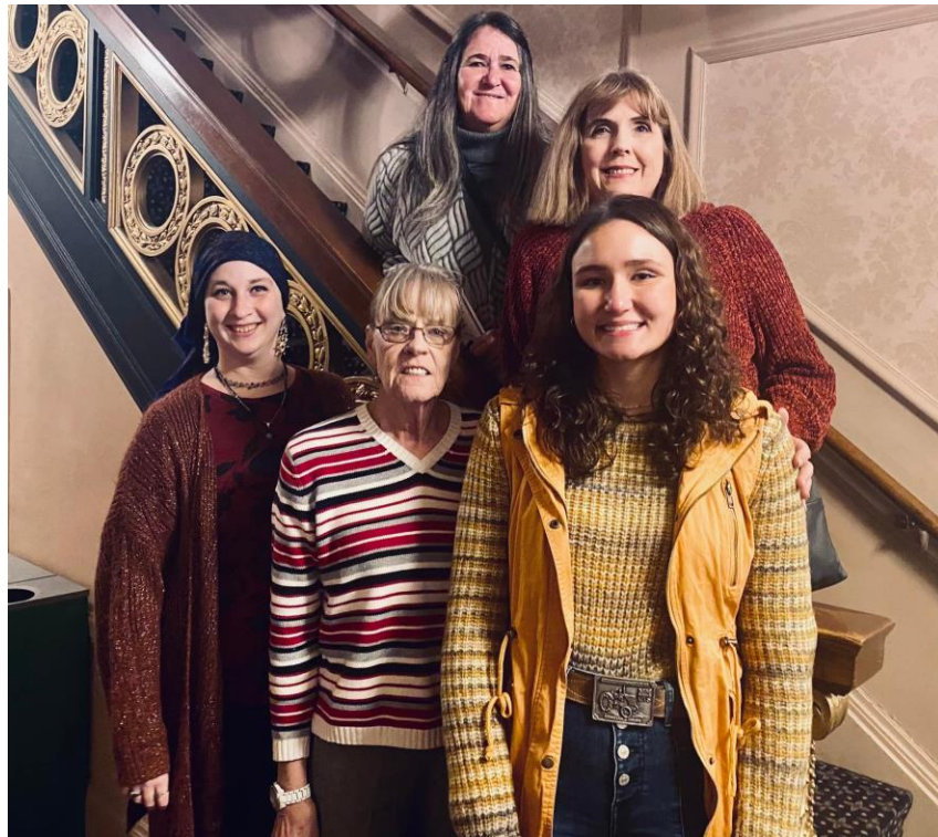
2023 Colony Store Staff

Thank you to all of our customers, as well as to the BHHA and their volunteers who help us so much throughout the year. Our goal as always in 2024 is to continue to provide a place for visitors to enjoy their visit as well as purchase Swedish treasures, souvenirs, food, and other gifts, and of course coffee and candy!! We look forward to seeing you all at the Colony Store in 2024!