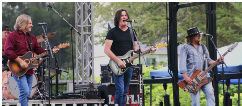
Little Texas Concert July 8, 2023