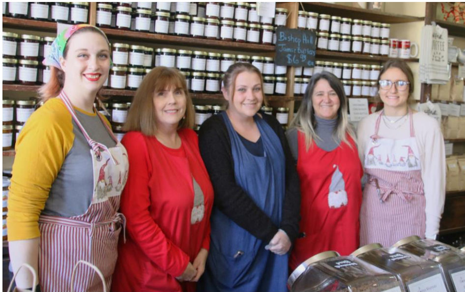
2022 Colony Store Staff

As we enter into 2023 and look back on 2022, we say to ourselves “Well, that was interesting!” We continued to see shipping delays and when we did receive shipments, we were met with sticker shock over increased delivery charges and price increases as well as continued outages of products. As we moved through the year, we then experienced the summer of high gas prices and food. Our numbers were down from previous years as far as sales went, but we did seem to still have a good flow of visitors. Fall in Bishop Hill is always beautiful, it made for great visitor and sales numbers, and we ended November with a record month going as far back as 2014. Entering the holidays, we were excited as always for our many events and with the weather cooperating, with the exception of the couple of days before Christmas; we had a great holiday season. We get so many compliments from our patrons on how much they love and appreciate The Colony Store. Our goal as always in 2023 is to continue to provide a place for visitors to enjoy their visit as well as purchase Swedish treasures, souvenirs, food and other gifts, and of course coffee and candy!! We look forward to seeing you all at The Colony Store in 2023!