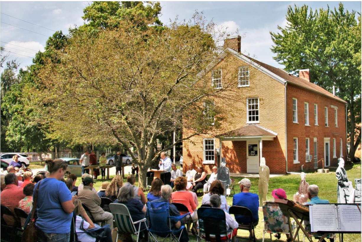
Carpenter Building Rededication Ceremony August 24, 2019