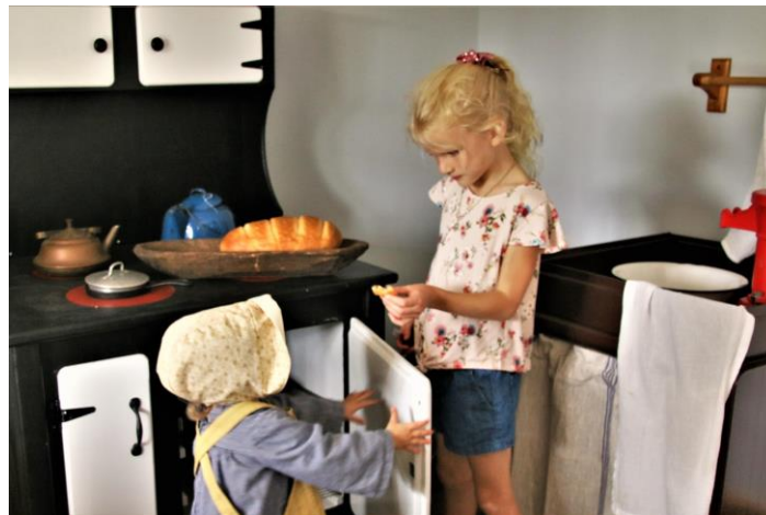
Completed Spets Stuga