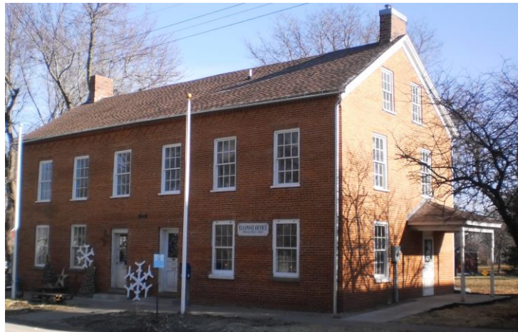
Restored 1851 Colony Carpenter Building