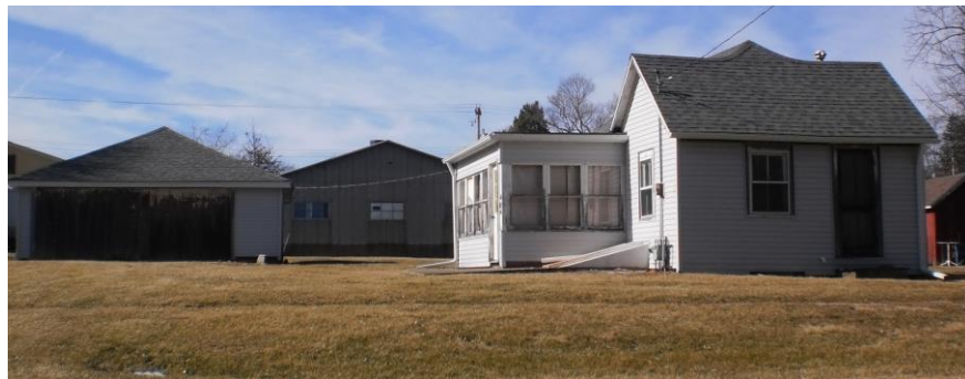
Shown as purchased by the BHHA.