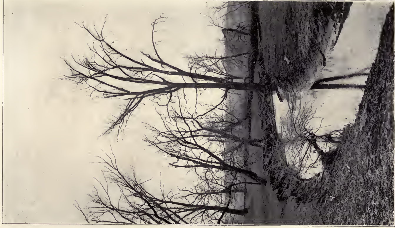
The Mill Stream