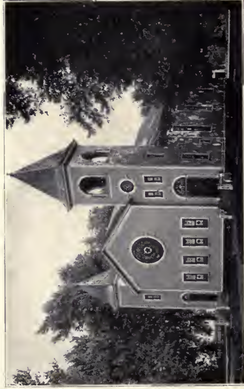
Community M. E. Church as Re-modeled in 1899.