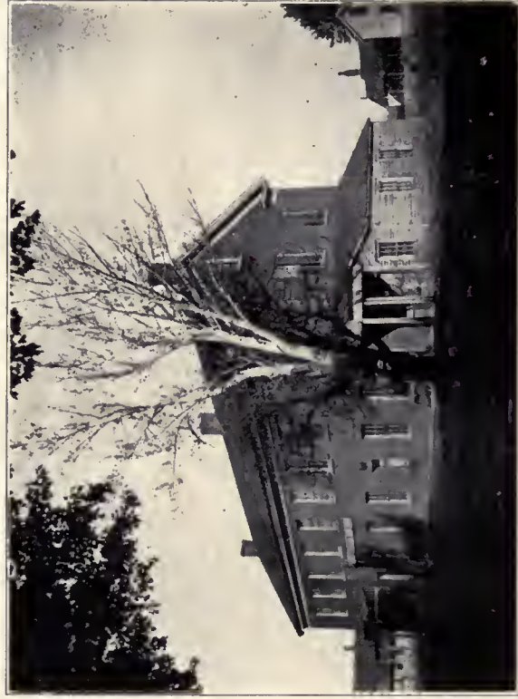
Blacksmith Shop. Upper Floor Used as Carpenter Shop