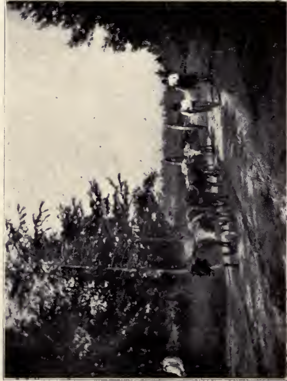
Familiar Scene in Early Pioneer Days