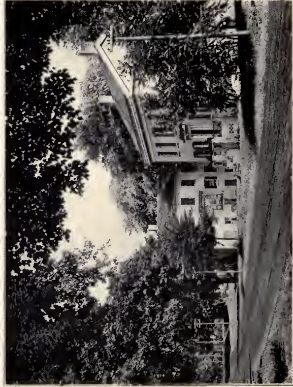
Old Colony Buildings