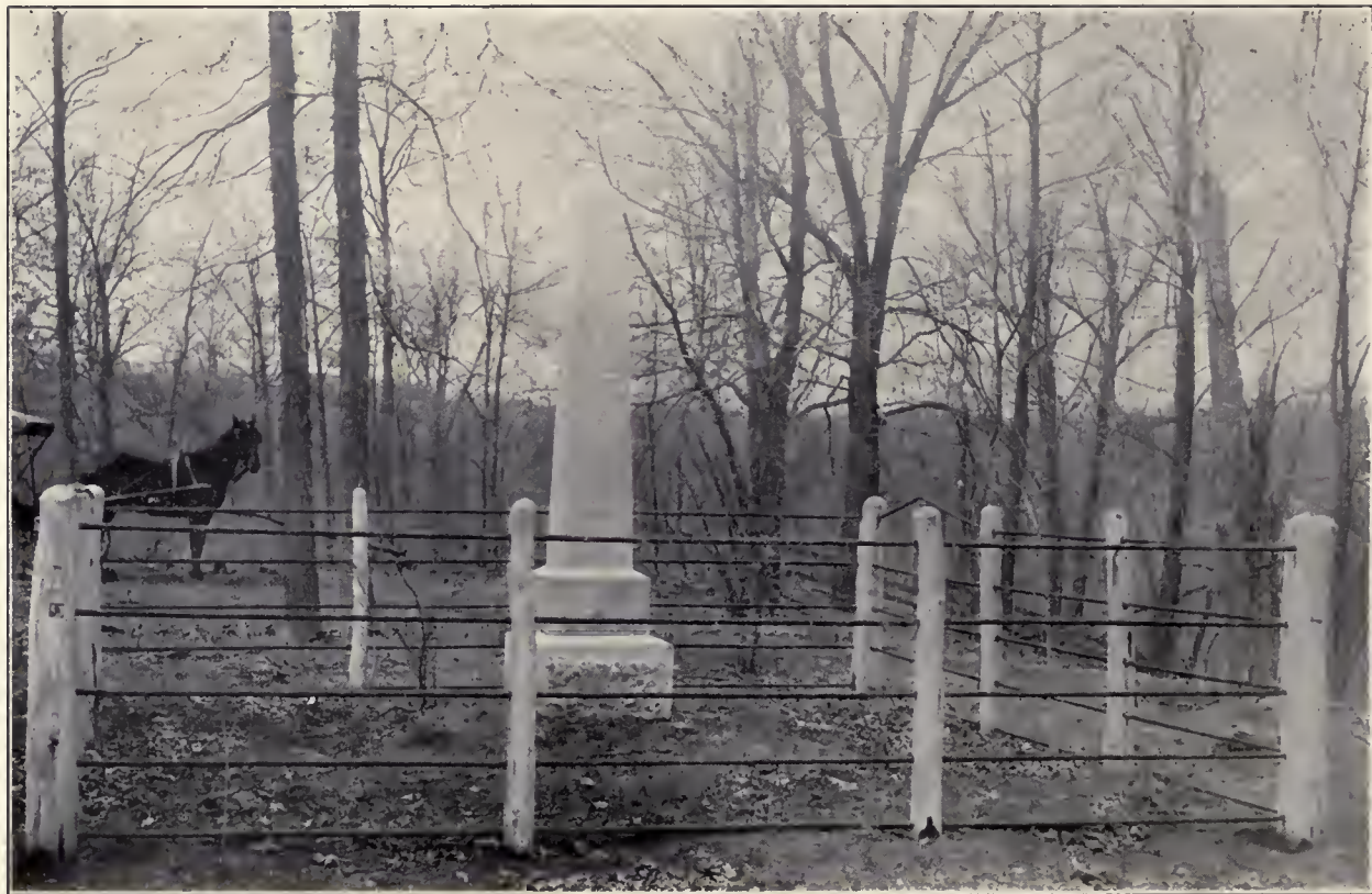
Monument in Red Oak, dedicated in 1882 in Memory of 50 Colonists who died in 1846-47. A replica of this Monument dedicated at LaGrange at the same time in Memory of 70 Cholera Victims.