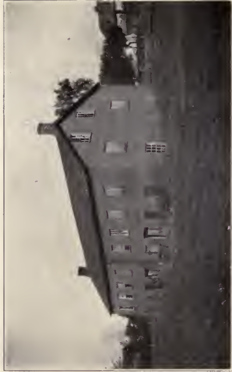
Old Colony Bakery and Brewery