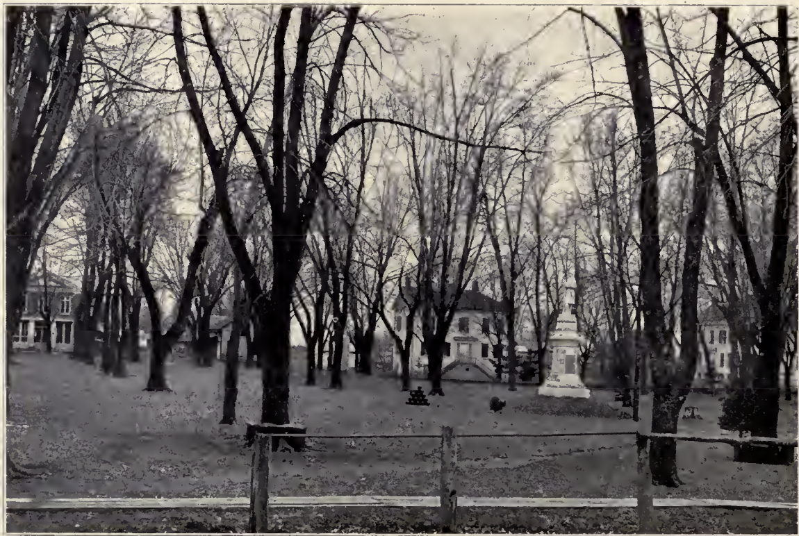
View of Public Park from Northeast. In this Park Old Settlers' Re-Unions have been held Annually on September 23rd for Twenty-five Years