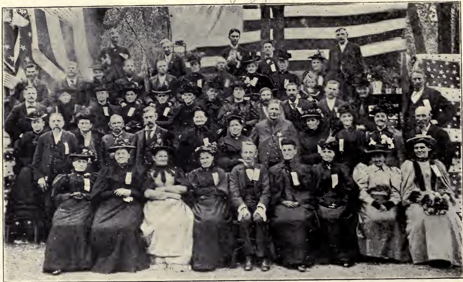
"Young" Old Settlers Group. 50th Anniversary, 1896