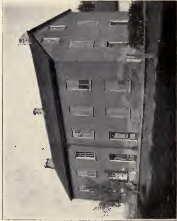
Carriage and Wagon Shop. Second Floor Used as Paint Shop