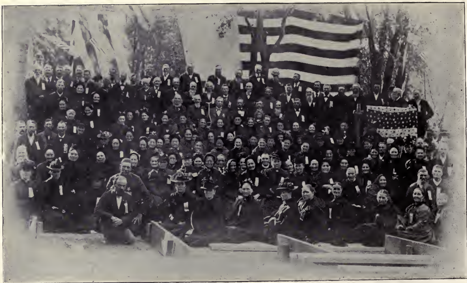
Old Settlers Group. 50th Anniversary, 1896.