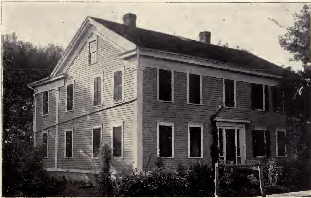
Colony Hospital Building