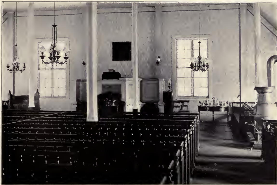
Interior, Old Colony Church. Pews are Native Black Walnut. Spindles of Maple