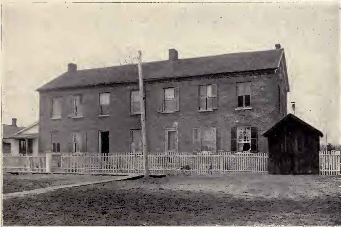
Dairy Building. Butter and Cheese Factory. Harness and Brooms were also Made in this Building.