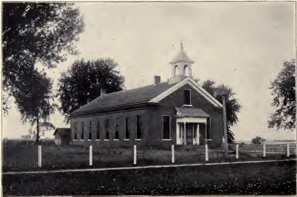
Bishop Hill School House. Built in 1860