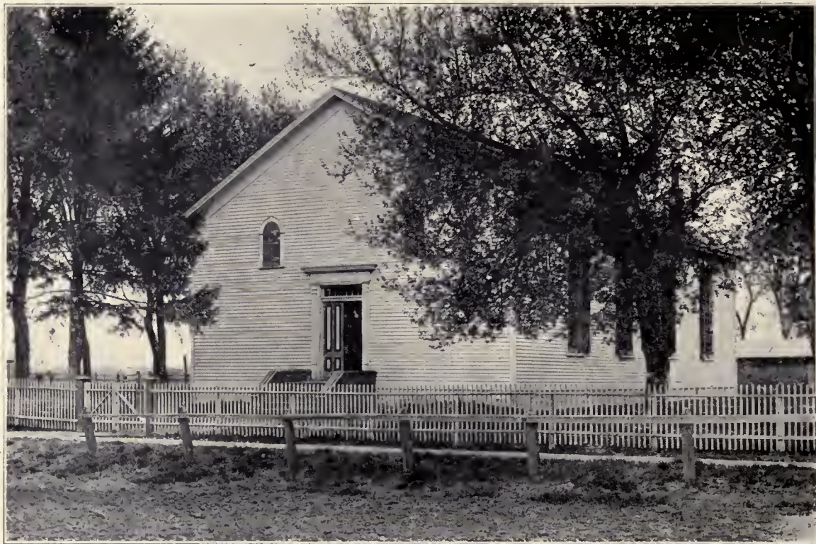
M. E. Church, Erected 1869