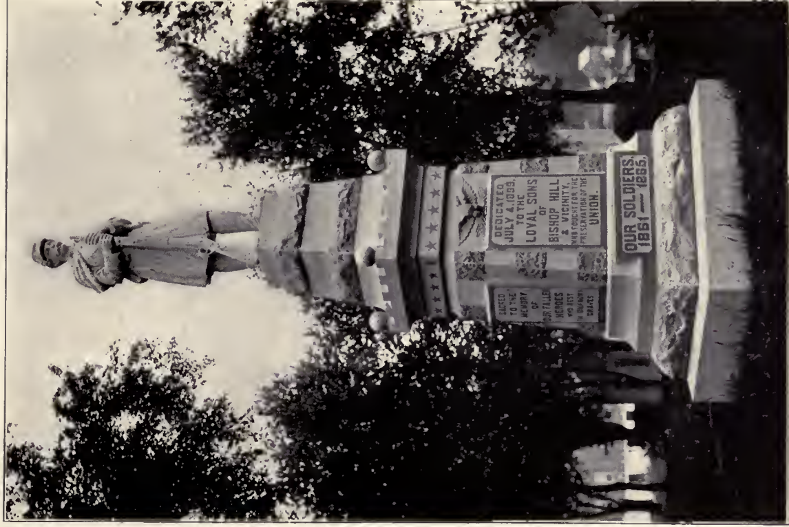
Soldiers' Monument in Public Park, Dedicated July 4, 1899.