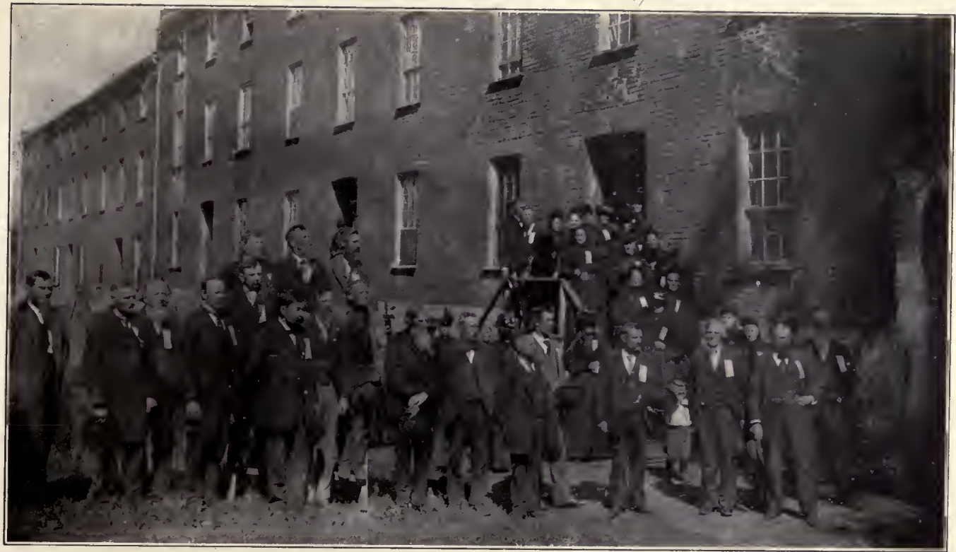
Old Settlers Group. 50th Anniversary, 1896.