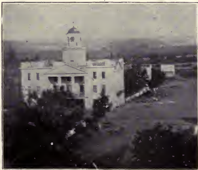
Steeple Building as Originally Built