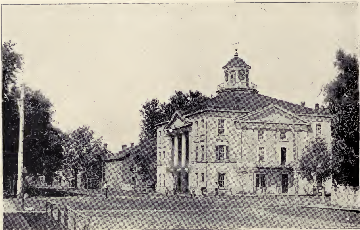
Steeple Building. Built in 1854. Clock installed in 1859 was made by Three Colonists and Patterned after a Hall Clock. This home-made movement has faithfully recorded every passing hour for 62 years