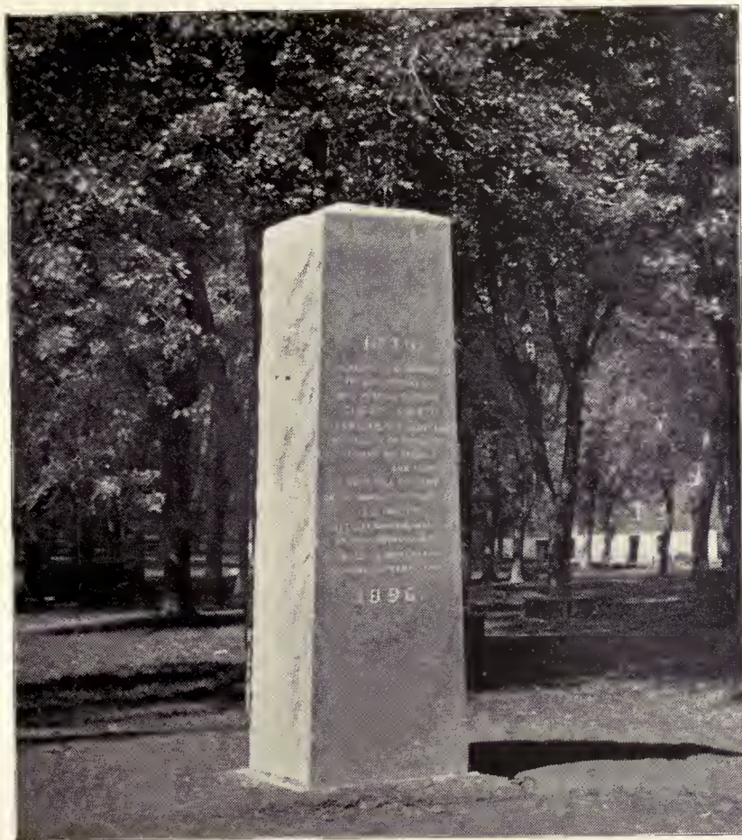
Old Settlers' Monument, Bishop Hill, Ill.