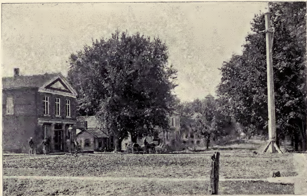
Street Scene. Looking West South Side of Park