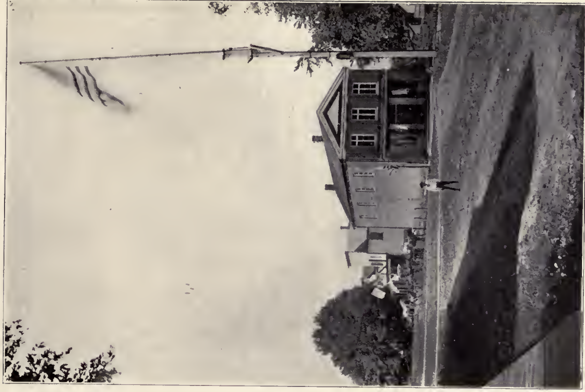
Colony Store and Post Office