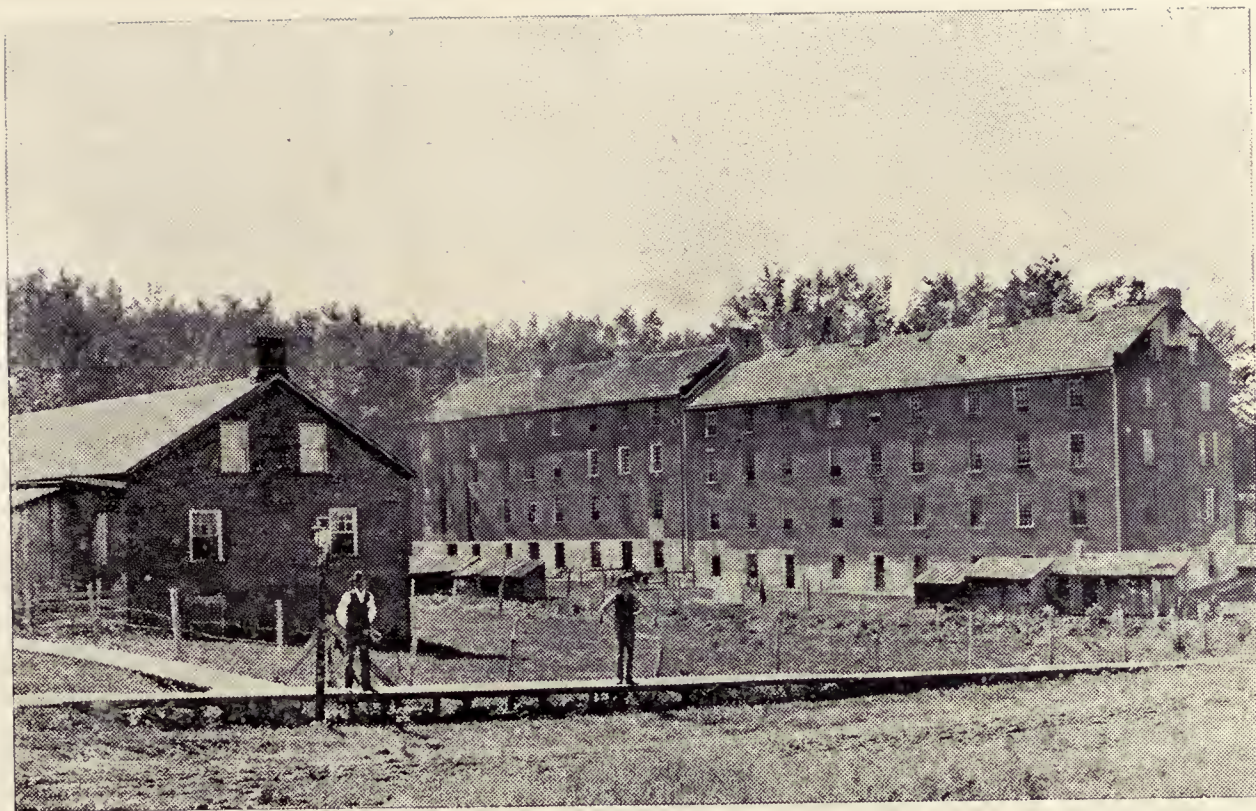
"Big Brick." Basement used as Kitchen and Dining Rooms. Eighteen Women worked in the Kitchen. Twelve Waitresses Served the Food.