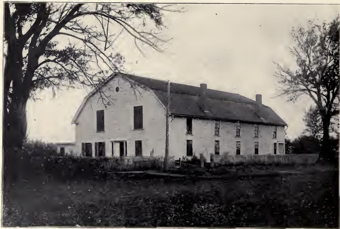
Old Colony Church. Erected 1848