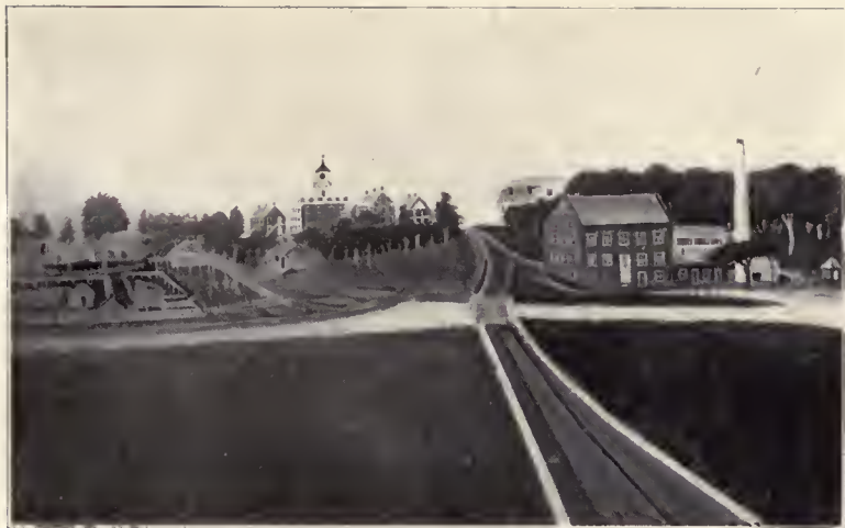
View of Bishop Hill from the North in 1855. Steam Mill in the Fore-ground. Taken from a painting