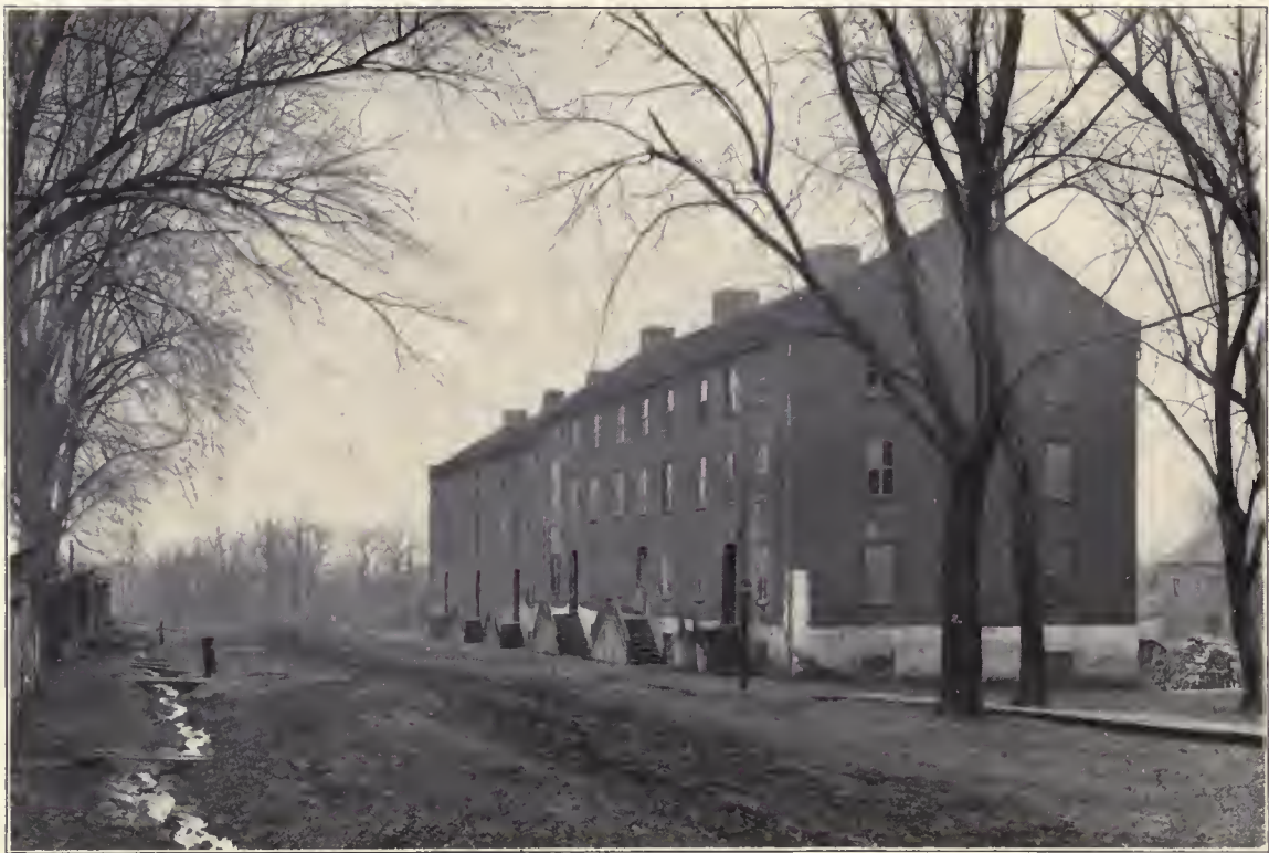
"Big Brick" Erected in 1848-51. Four Story Building. 45x200 Feet. Contains 96 Large Rooms. Also 6 Halls.