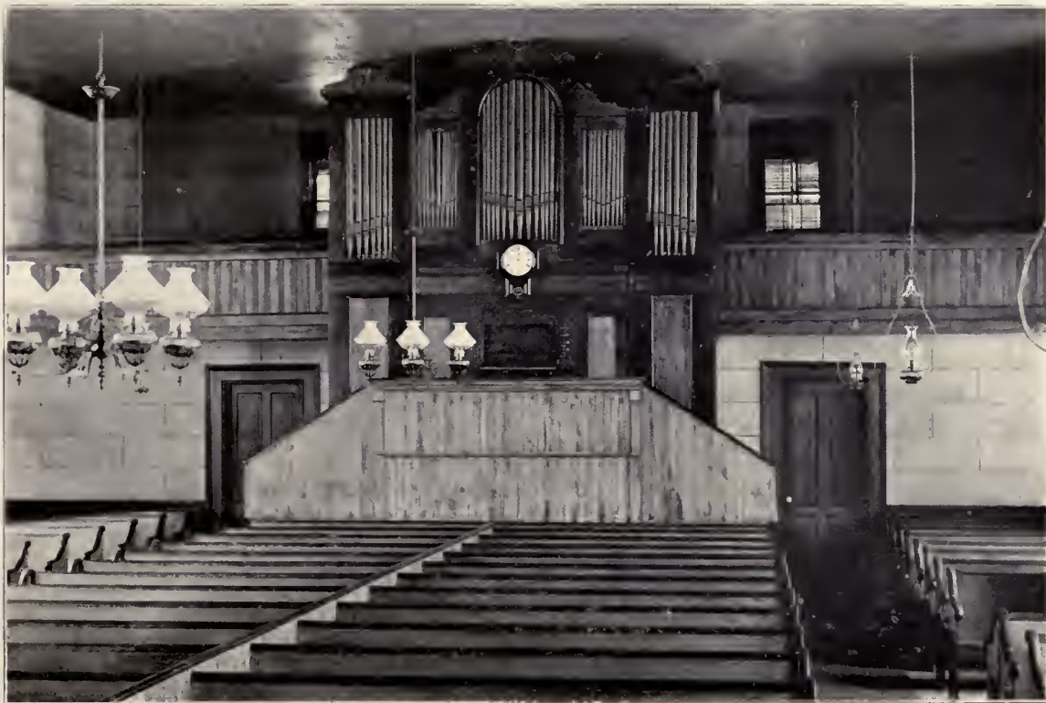
Interior View of M. E. Church, Showing Pipe Organ