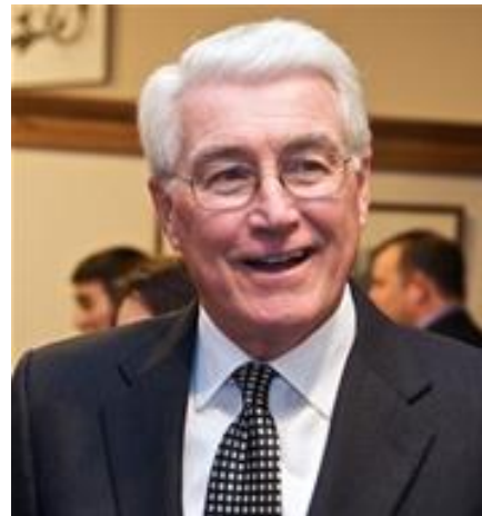
Former Illinois Governor Jim Edgar