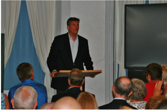
State Senator Darin LaHood